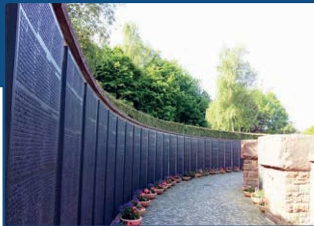
The semi-circular aisle with the bronze plates.

BANK: Kieler Volksbank eG IBAN: DE49 2109 0007 0090 1702 02 BIC: GENODEFIKIL ACCOUNT NO: 90170202 BANKCODE: 21090007